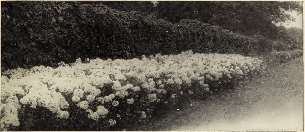
Border of Hardy Phlox